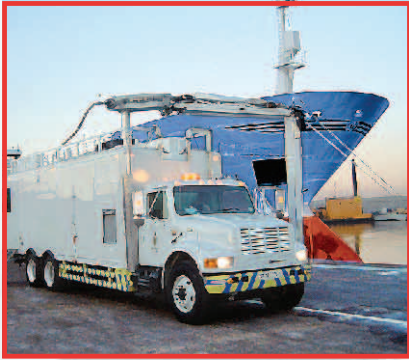
MobileSearch™ Z ® Backscatter and Transmission X-ray with Radioactive Threat Detection capability