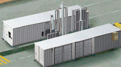
Relocatable Shaped Energy™ 3.5 MeV Platen Configuration

AS&E is the technology leader in port security, offering the combination of Z ® Backscatter and transmission X-ray imaging; Shaped Energy™ for high penetration of sea containers; Backscatter-Only screening capabilities; and now, Radioactive Threat Detection (RTD). RTD technology can detect potential dirty bombs and nuclear devices, while producing X-ray images of a container simultaneously . These technologies are available in AS&E's CargoSearch™ family of products for the rapid X-ray inspection of vehicles and cargo at ports worldwide.