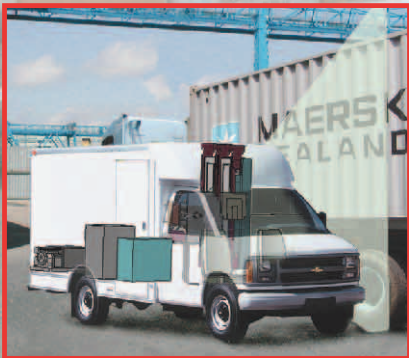
Z ® Backscatter Van™ Backscatter-only Rapid drive-by pre-screening

AS&E is the technology leader in port security, offering the combination of Z ® Backscatter and transmission X-ray imaging; Shaped Energy™ for high penetration of sea containers; Backscatter-Only screening capabilities; and now, Radioactive Threat Detection (RTD). RTD technology can detect potential dirty bombs and nuclear devices, while producing X-ray images of a container simultaneously . These technologies are available in AS&E's CargoSearch™ family of products for the rapid X-ray inspection of vehicles and cargo at ports worldwide.